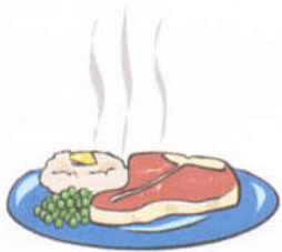
Second course "Meat" your friends in Rapid City!