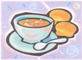
First course in Rapid City will be "souper"!