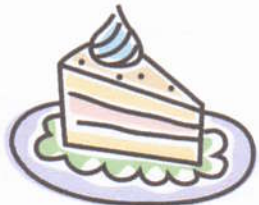
Third course Enjoy the icing on the cake in Sioux Falls!